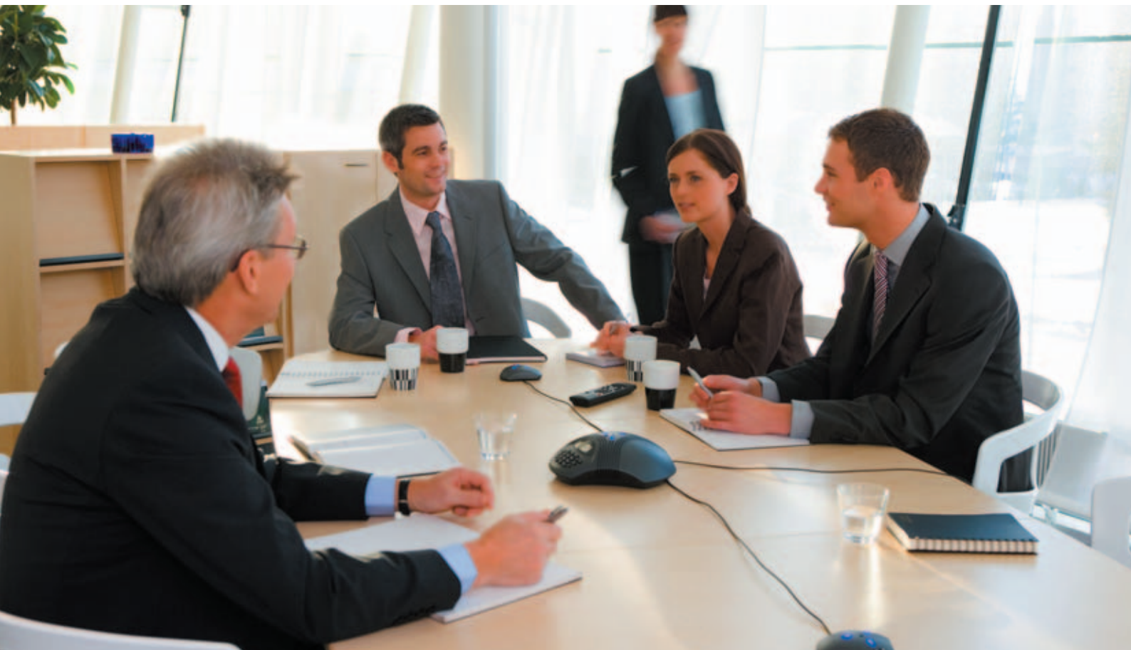
Conference phones for every situation